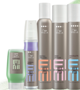
1 EIMI Sculpt Force 2 EIMI Thermal Image 3 Extra Volume 4 EIMI Stay Styled 5 EIMI Absolute Set

The hair was finished with EIMI Absolute Set where needed.