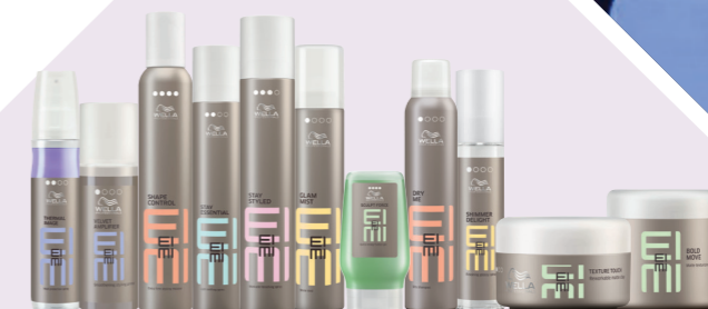
1 EIMI Thermal Image 2 EIMI Velvet Amplifier 3 EIMI Shape Control 4 EIMI Stay Essential 5 EIMI Stay Styled 6 EIMI Glam Mist 7 EIMI Sculpt Force 8 EIMI Dry Me 9 EIMI Shimmer Delight 10 EIMI Texture Touch 11 EIMI Bold Move

EIMI Texture Touch/ Bold Move was used lightly on the mid lengths and ends to add more texture and bulk to the hair.